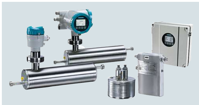
Sensors MASS 2100 and FC300 DN 4 with FCT010 / FCT030 transmitters

The SITRANS MASS 2100 and FC300 DN 4 system consists of a SITRANS sensor and a SITRANS FCT030 transmitter.